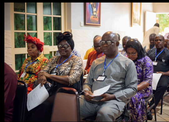
A Cross Section Photo of the attendance